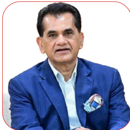
Mr. Amitabh Kant India's G20 Sherpa and Former CEO, NITI Aayog