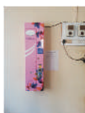
For Women's Hygiene