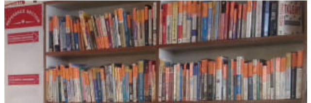
The IMER MBA About Relevance, Exposure, and Placements