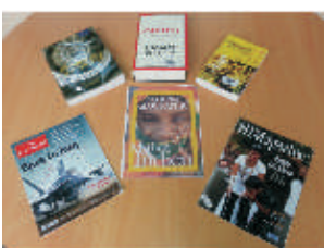
New Magazines and Books