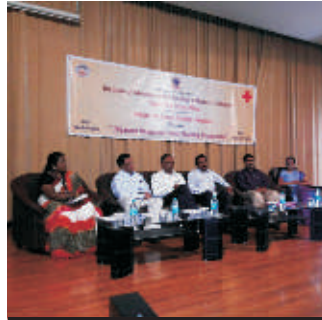
Disaster Response Team Training